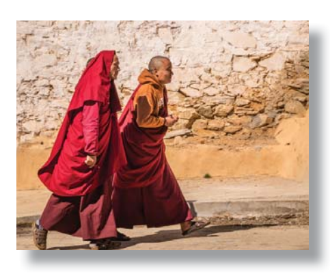
14 – Walking .jpg Among my favorites, just not at the top. Well done.

Good decisive moment and composition, but doesn't doesn't speak "motion" to me as much as I'd like. Processing seems flatter than I'd expect for that contrasty a scene.